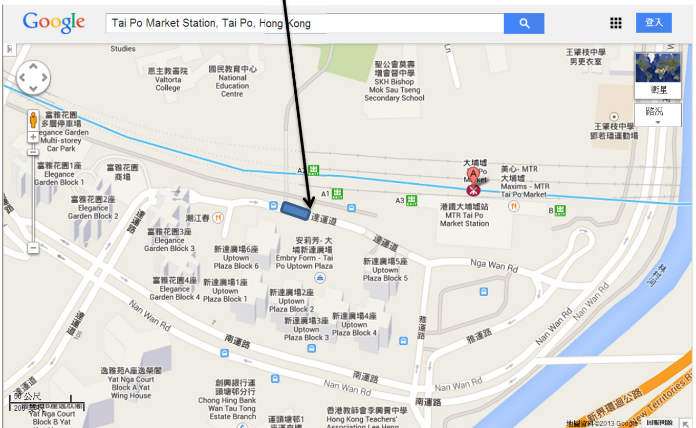
Tai Po Market Station, Tat Wan Road (Exit A)